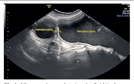
Fig 1. Ultrasound scan showing the fluid in the vagina (hematocolpos) and showing fluid-filled uterus (hematometra).

lowing visits 2 weeks later and 2 months later she described a normal menstrual period and ultrasonography revealed a normal endometrium and uterus with a thick and long cervix.