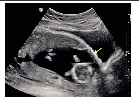
Fig 1. Ultrasound showing a gestational sac containing a single fetus with cardiac pulsation evident. Empty uterine cavity and focal thinning of the overlying myometrium (arrow, 0.2 cm) were noted. Fetal biometry: crown-rump length = 7.26 cm (13.5 weeks); biparietal diameter = 2.57 cm (14.5 weeks).

dropped to 63001 IU/L and 35736 IU/L on the third and seventh post-injection day respectively, and normalized after 12 weeks. She had an episode of moderate vaginal bleeding 8 weeks after the injection followed by regular menses. Ultrasound showed continual regression in size of the gestational mass to 1-2 cm after 10 months.